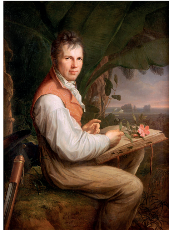
Fig. 2: Friedrich Georg Weitsch (1758–1828). Alexander von Humboldt, 1806, Oil on canvas, 126 x 92.5 cm, Alte Nationalgalerie, Berlin, Germany

Both men's fascination with geography and their respective contributions to this discipline are again just as interesting. 2 Let us start by saying that Kant was a genuine Gelehrter , a German word usually translated as sage and which, in Kant's case, can perfectly fall short if we really attempt to describe him: his wisdom was such that yes, he knew much about many things, but none superficially or lightheartedly... he examined the very depths of all issues he attended to. Yes, he is a sage among sages, throughout his writings we see what in German is known as Gründlichkeit , i. e., soundness, close attention, and assiduousness in thought and knowledge.