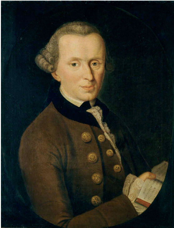
Fig. 1: Johann Gottlieb Becker (1720–1782). Immanuel Kant, 1768, Oil on canvas, 59 x 46 cm, Schiller-Nationalmuseum, Marbach am Neckar, Germany. Wikimedia Commons, https://commons.wikimedia.org/wiki/File:Kant_gemaelde_3.jpg