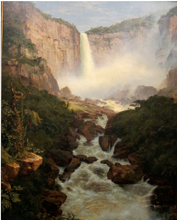
Fig. 4: Frederick Edwin Church (1826–1900). Tequendama Falls near Bogotá, New Granada, 1854, Oil on canvas, 59 x 46 cm, Cincinnati Art Museum, Cincinnati, USA. Wikimedia Commons, https://commons.wikimedia.org/wiki/File:Frederic_Edwin_Church_-_Tequendama_Falls,_Near_Bogota,_New_Granada.jpg

Yet, this rendez vous , which was in fact no more than Kant's imprecise reference to Humboldt's voyage (at the time underway) to South America, heralds further encounters when we get to what Kant had to say on waterfalls in paragraph 60 of his Physical Geography : "The (River) Rhine," he writes, "has several (water)falls. The one near Schaffhausen (Switzerland) has a vertical height of 75 feet. The one in El Velino, Italy, drops 200 precipitous feet." Then, he adds: "The world's highest [fall] stands in the Bogotá River, South America, at a vertical drop of 1200 feet." 14