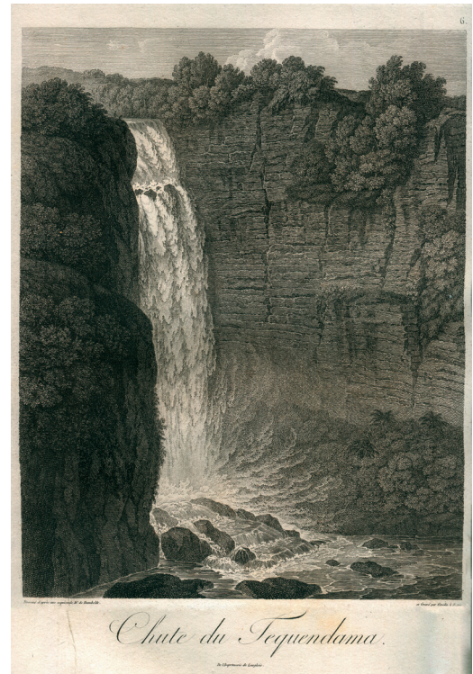
Fig. 5: Alexander von Humboldt (1769–1859) / Wilhelm Friedrich Gmelin (1745–1821). Chute du Tequendama, 1810, Engraving and etching on paper, 56.5 x 39.7 cm (Humboldt, Alexander von. Vues des cordillères et monumens des peuples indigènes de l'Amérique . Paris: F. Schoell, 1810, planche VI, opposite p. 19). Biblioteca General, Pontificia Universidad Javeriana, Bogotá, Colombia.